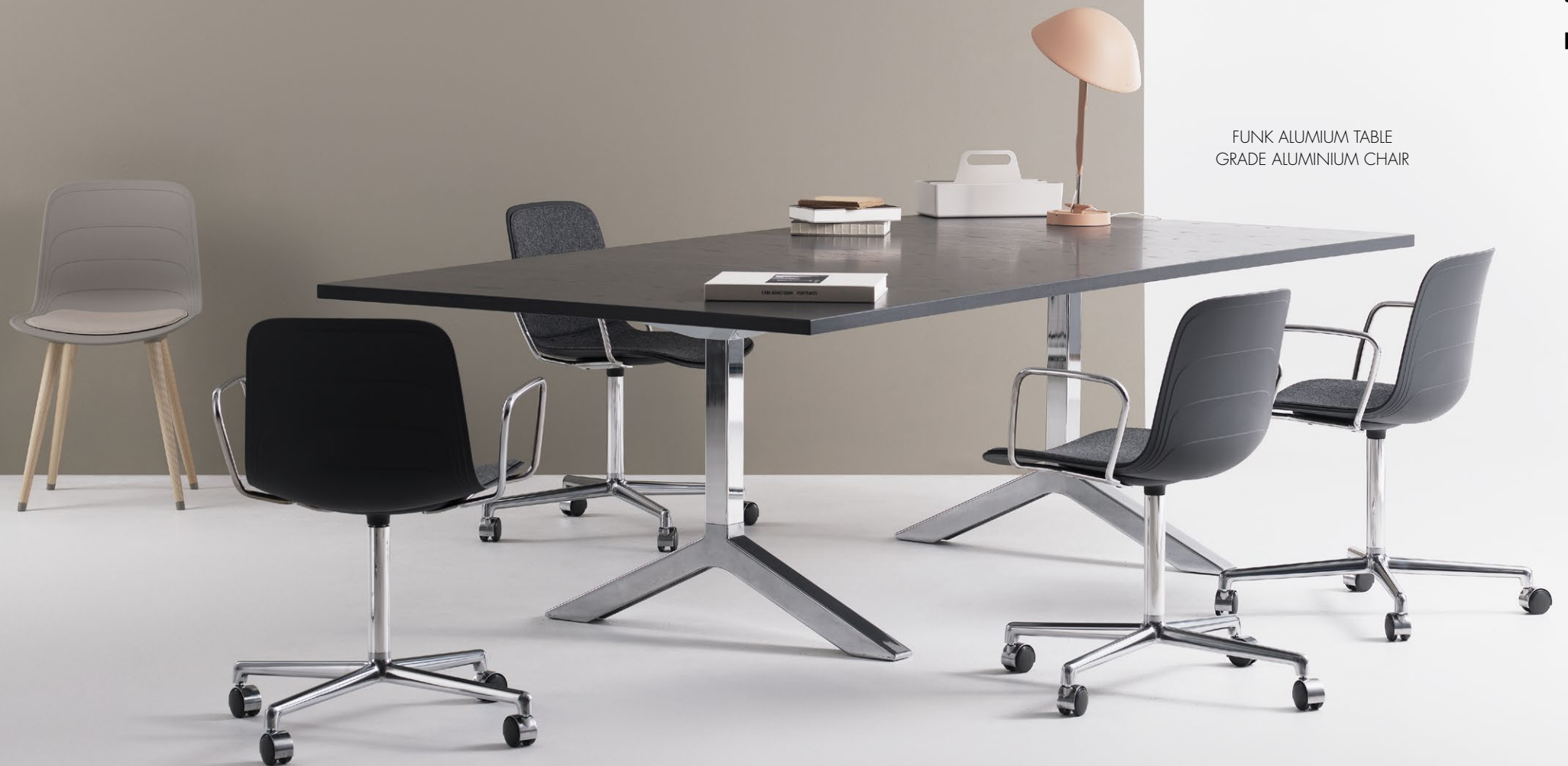
FUNK ALUMIUM TABLE GRADE ALUMINIUM CHAIR