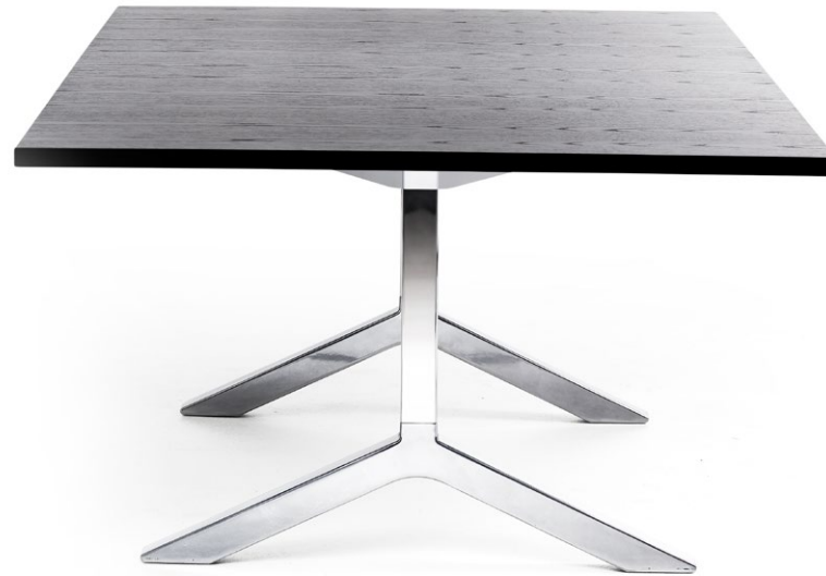
FUNK ALUMINIUM TABLE