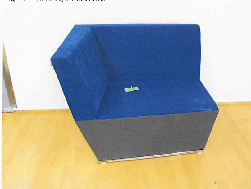
Figure 1 Area sofa end section

Frame: OSB – Fibreboard 12 mm Seat: Rubber webbing, cold cured foam 60 mm Back: Cold cured foam 40 mm Underframe: Chromium plated steeltube Ø22 mm