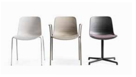
FOR MORE INFORMATION ABOUT GRADE PLEASE VISIT WWW.LAMMHULTS.SE

+46 472 26 95 00 Phone +46 472 26 05 70 Fax info@lammhults.se www.lammhults.se