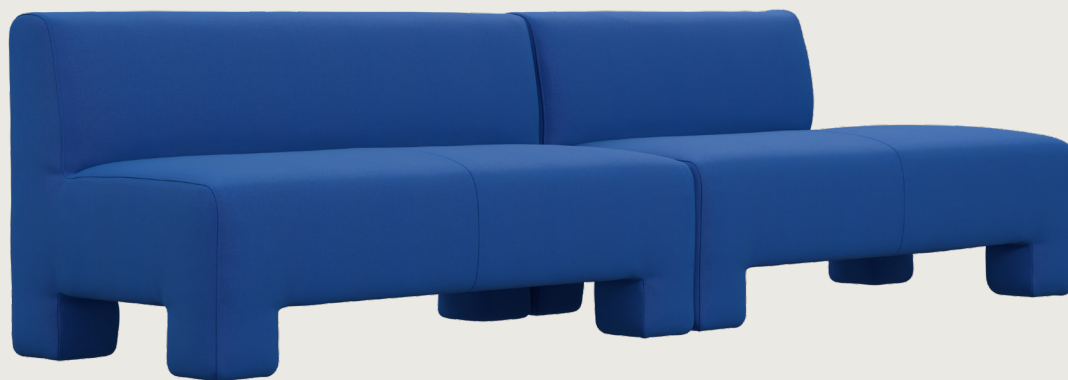
GEOFANTI Modular seating Design: Anya Sebton, 2024