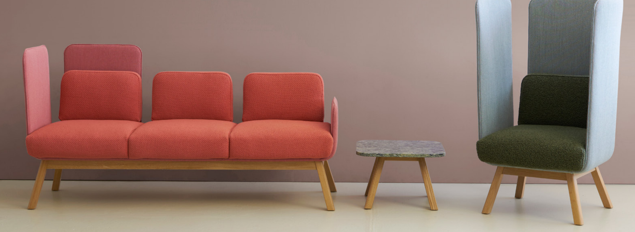
hm10w 3-seat sofa with mid-back, 10g high-back/side chair & 10y3 table

In 2015 Ineke moved back to the UK to set up studio-salon: design studio & research salon. From London she works with her studio in Holland on design projects for leading international design manufacturers and with the salon she explores 'the future of furniture design' and 'the changing position of the designer'. hm10 FLIX is her first collection for Hitch Mylius.