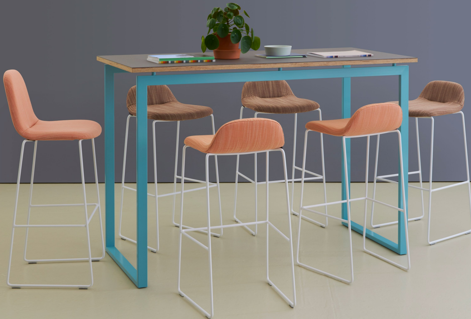
hm107d high table with hm58j and k barstools