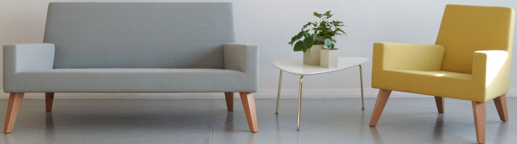
hm44b2 chair and e2 sofa with hm68p table