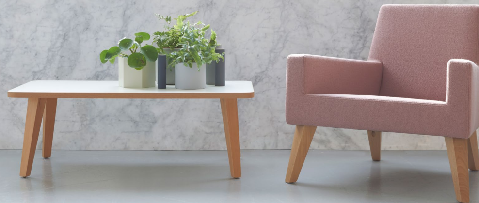
hm44b2 with f2 table