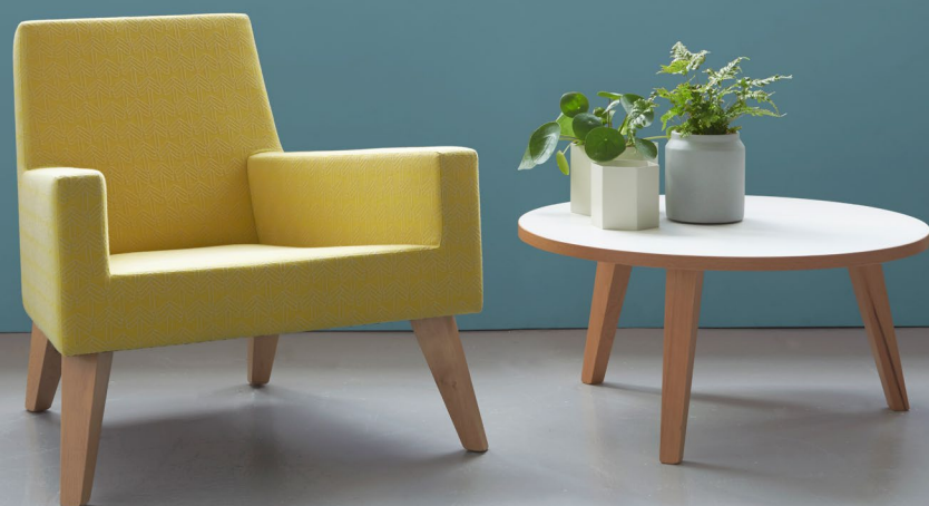
hm44b2 with g2 table