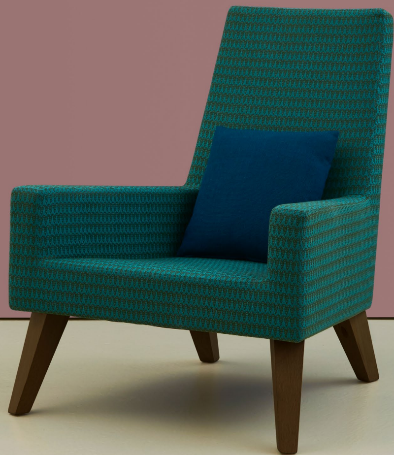
hm44a2 high-back armchair