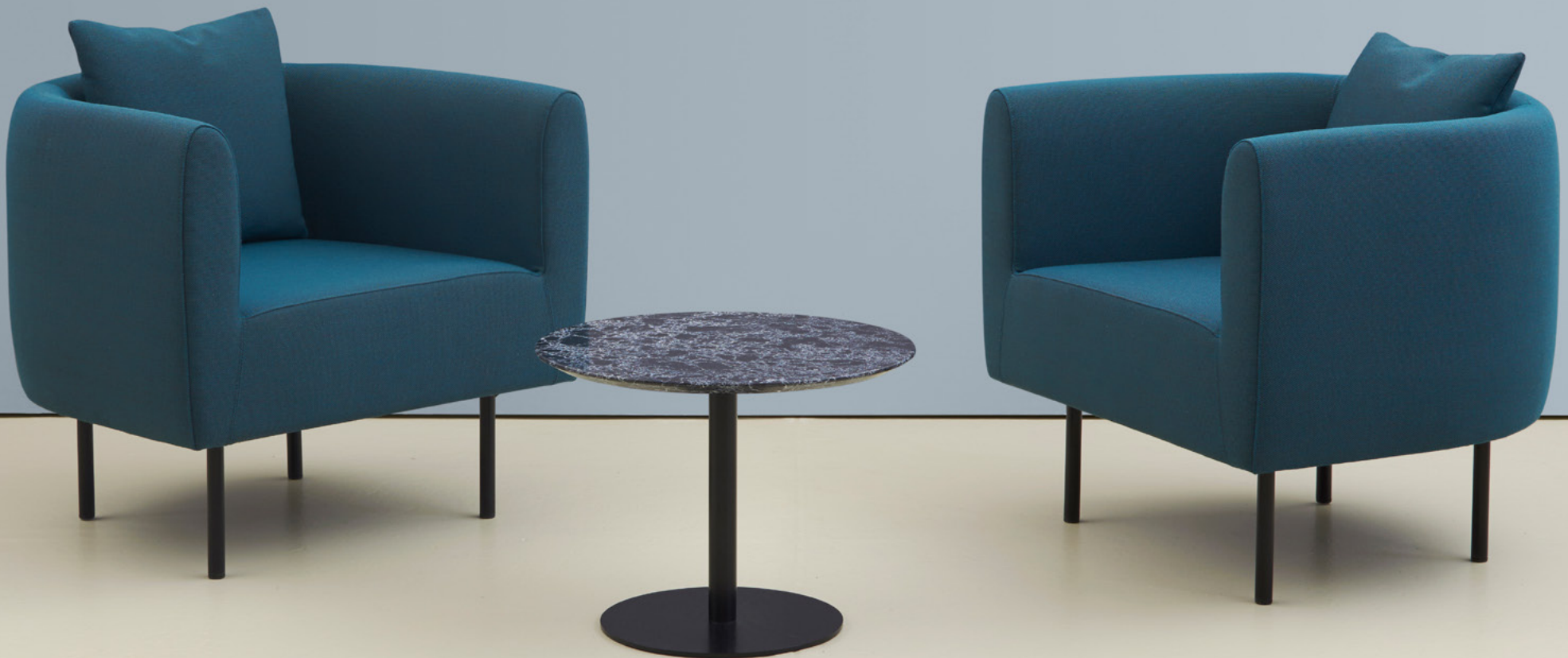
hm45a Juno tub-chairs with hm20c Disq table

His designs include the hm19 Reveal collection and the hm45 Juno chair and sofa, and he oversees the in-house product range as well as collaborating with external designers.