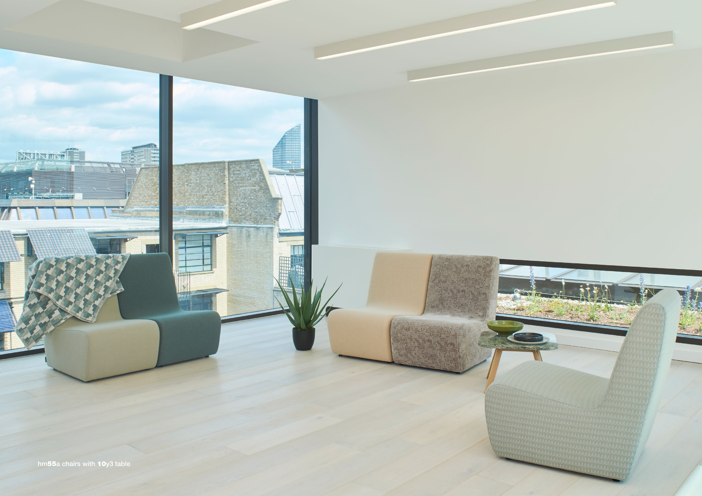
hm55a chairs with 10y3 table