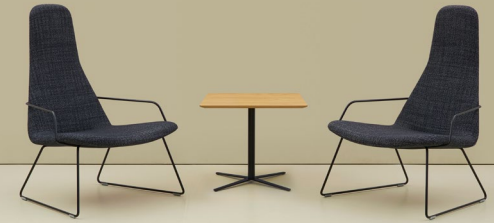
hm57b coffee table with hm59f lounge chairs