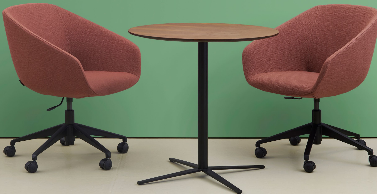
hm57n dining table with hm22d swivel armchairs