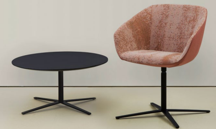
hm57k side table with hm22b armchair