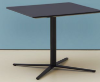
hm57b coffee table