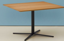
hm57h coffee table