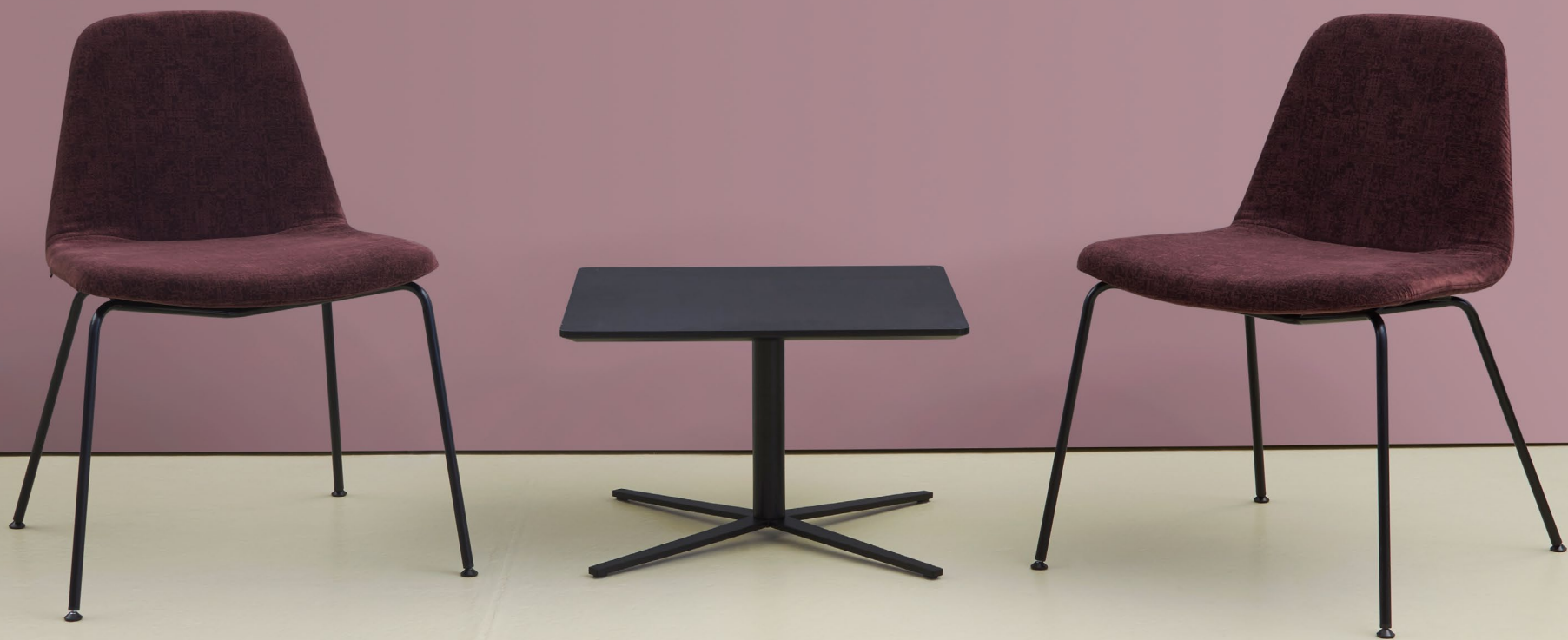
hm57a side table with hm58b 4-leg chairs