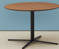
hm57m coffee table