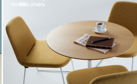
hm57n dining table with hm58a chairs