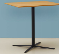
hm57f dining table