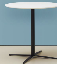
hm57n dining table