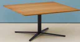
hm57g side table