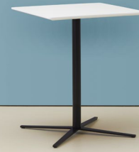
hm57c dining table