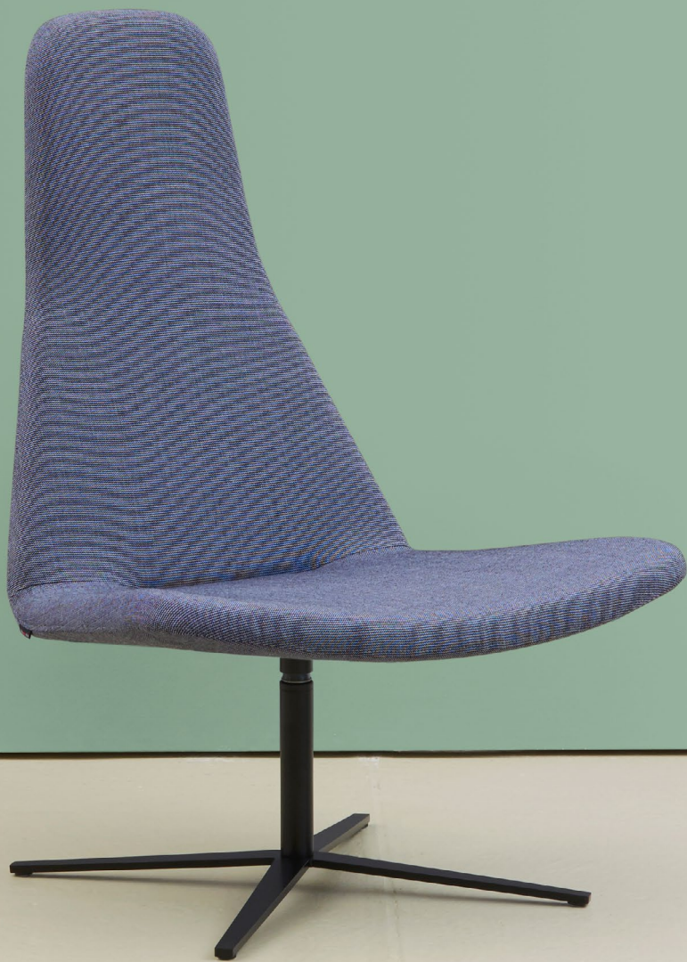
59g high-back swivel chair