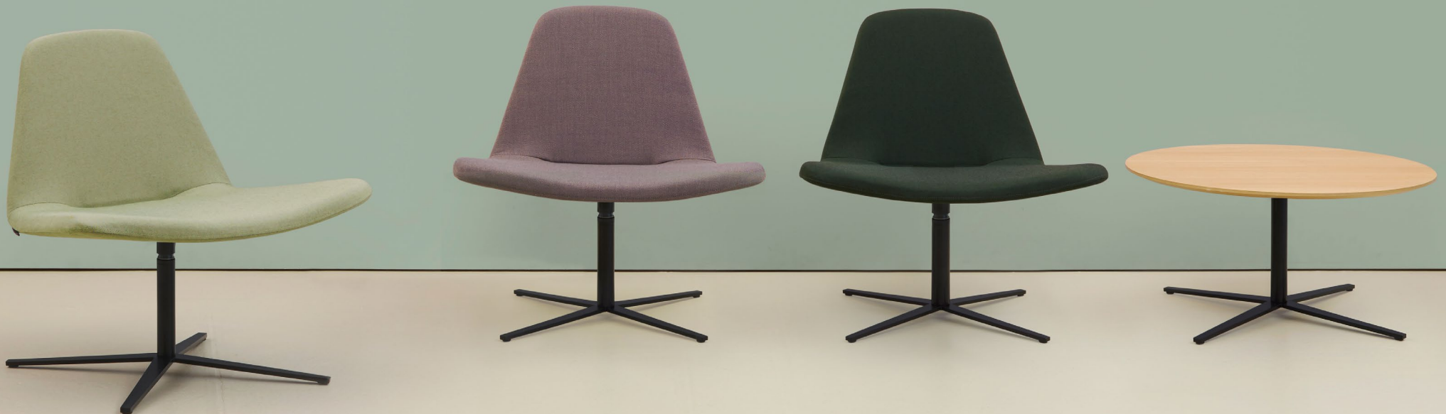
hm59c lounge swivel chair with hm57k side table