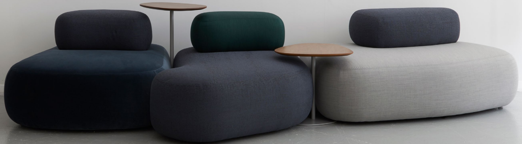
hm63a, b and c with h and j tables