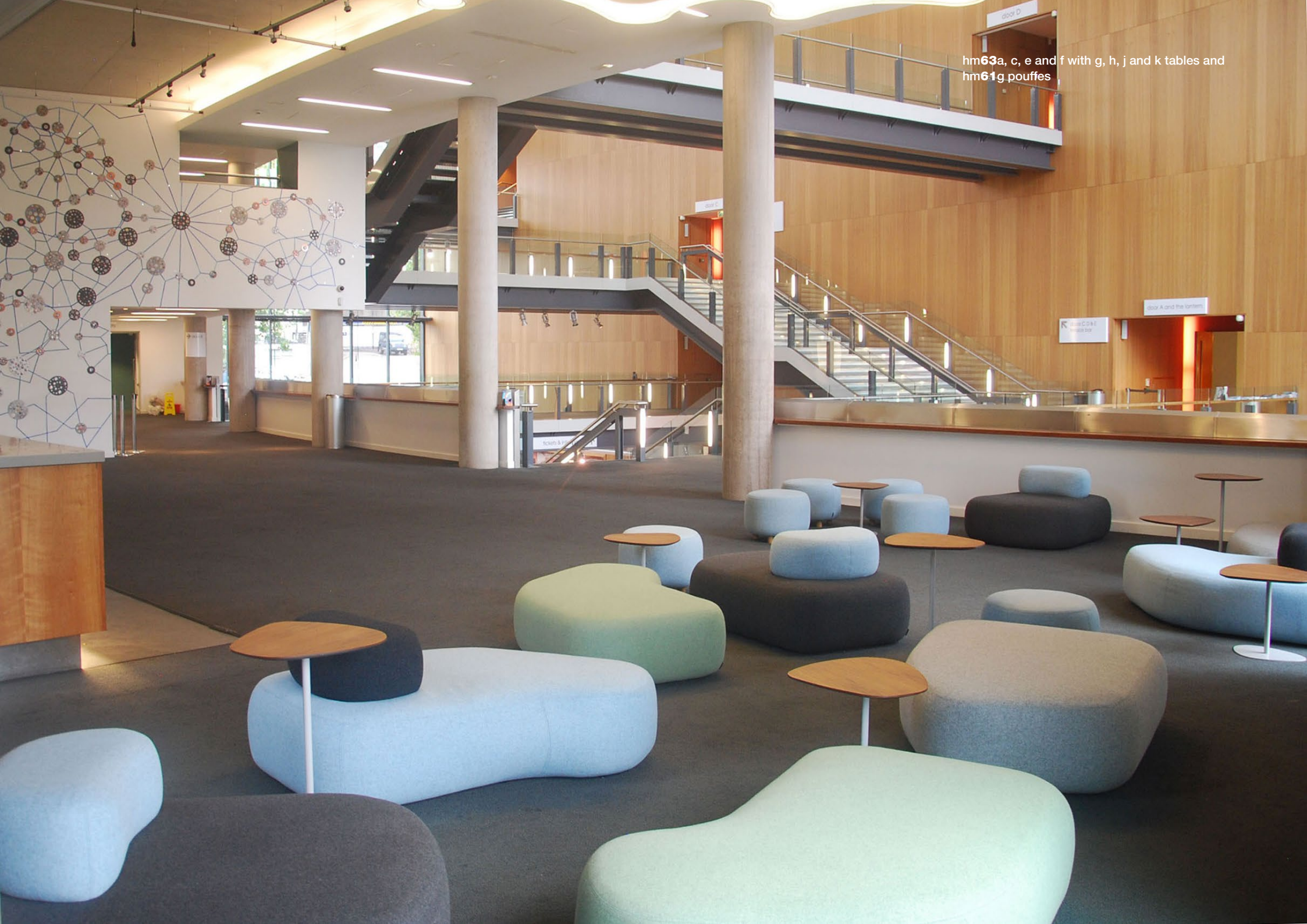
hm63a, c, e and f with g, h, j and k tables and hm61g pouffes