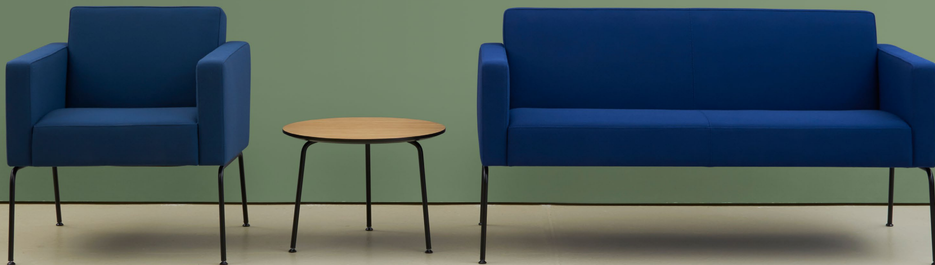
hm66a and b with hm68a table