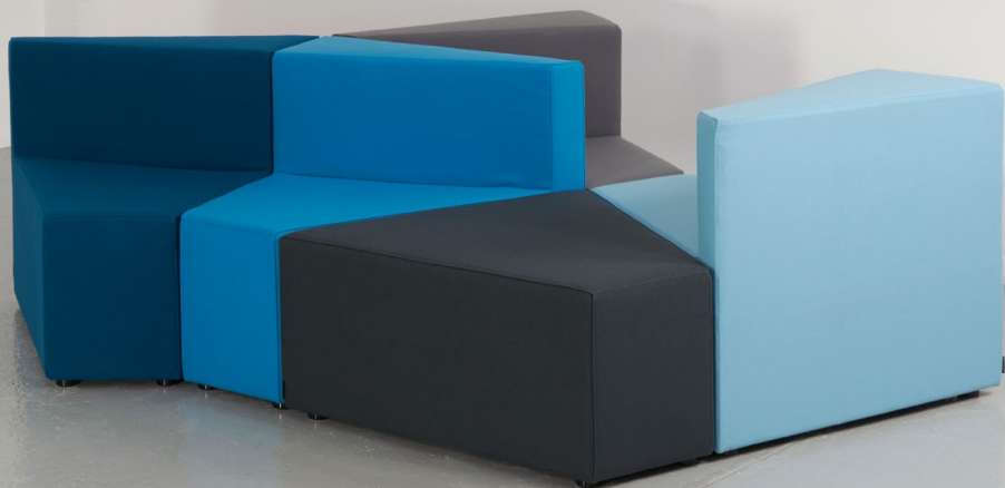
hm77a, b and c units