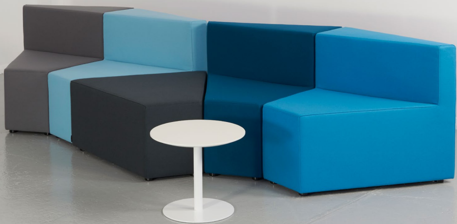
hm77a, b and c units with hm20a table