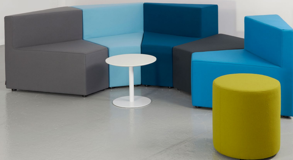
hm77a, b and c units with hm20a table and hm51b1 stool