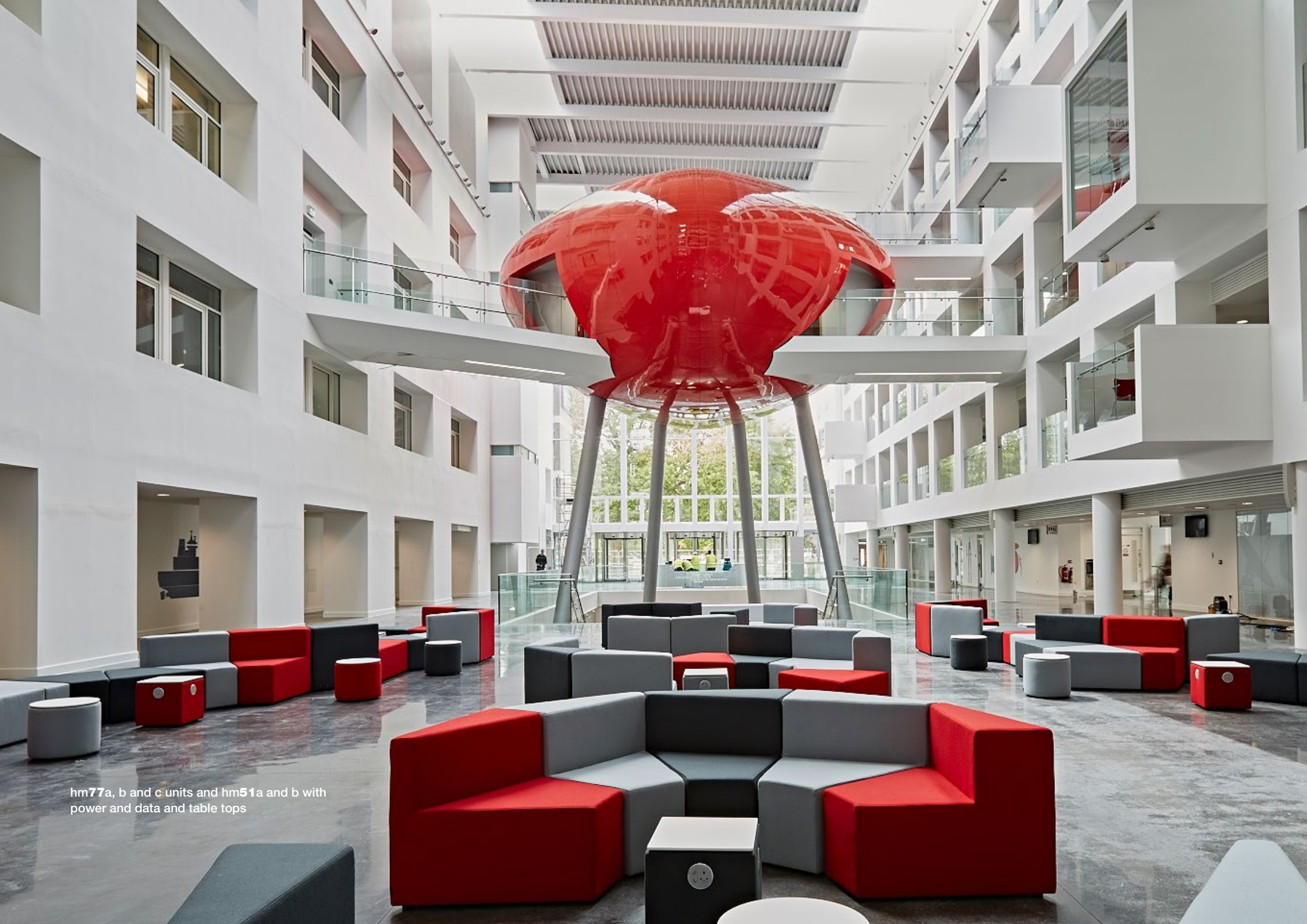
hm77a, b and c units and hm51a and b with power and data and table tops