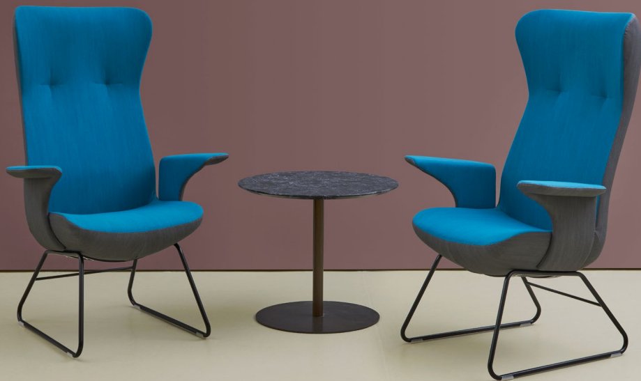
hm82b with cross-stitch detail and hm20f side table