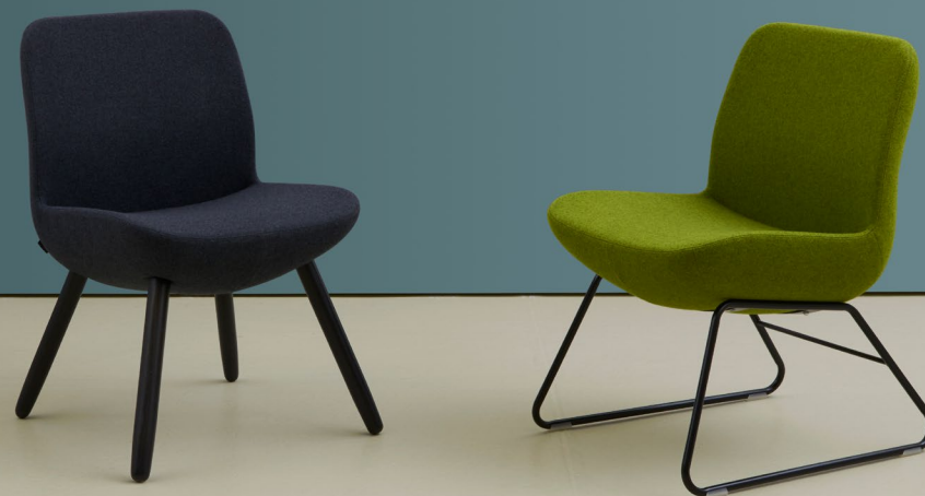
hm82g and h low-back chairs