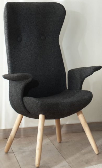
hm82a high-back armchair

In late 2009, Hitch Mylius commissioned Grange to develop the first of a new seating collection designed specifically for healthcare use, addressing the particular needs of the elderly. Thrilled to be working on a product aimed at an older generation of design-aware users, Grange admits that hm82 has been one of the most challenging – and rewarding – jobs he has ever tackled.