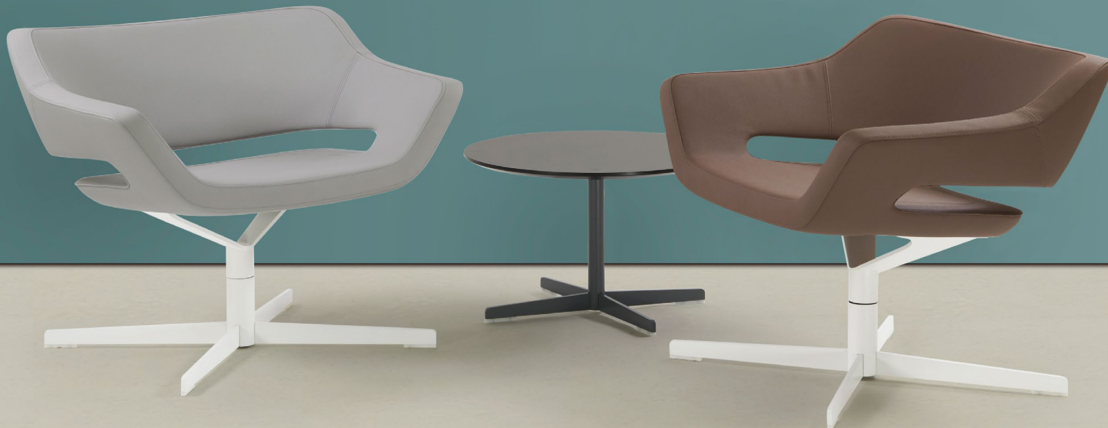
hm85a chairs and b table