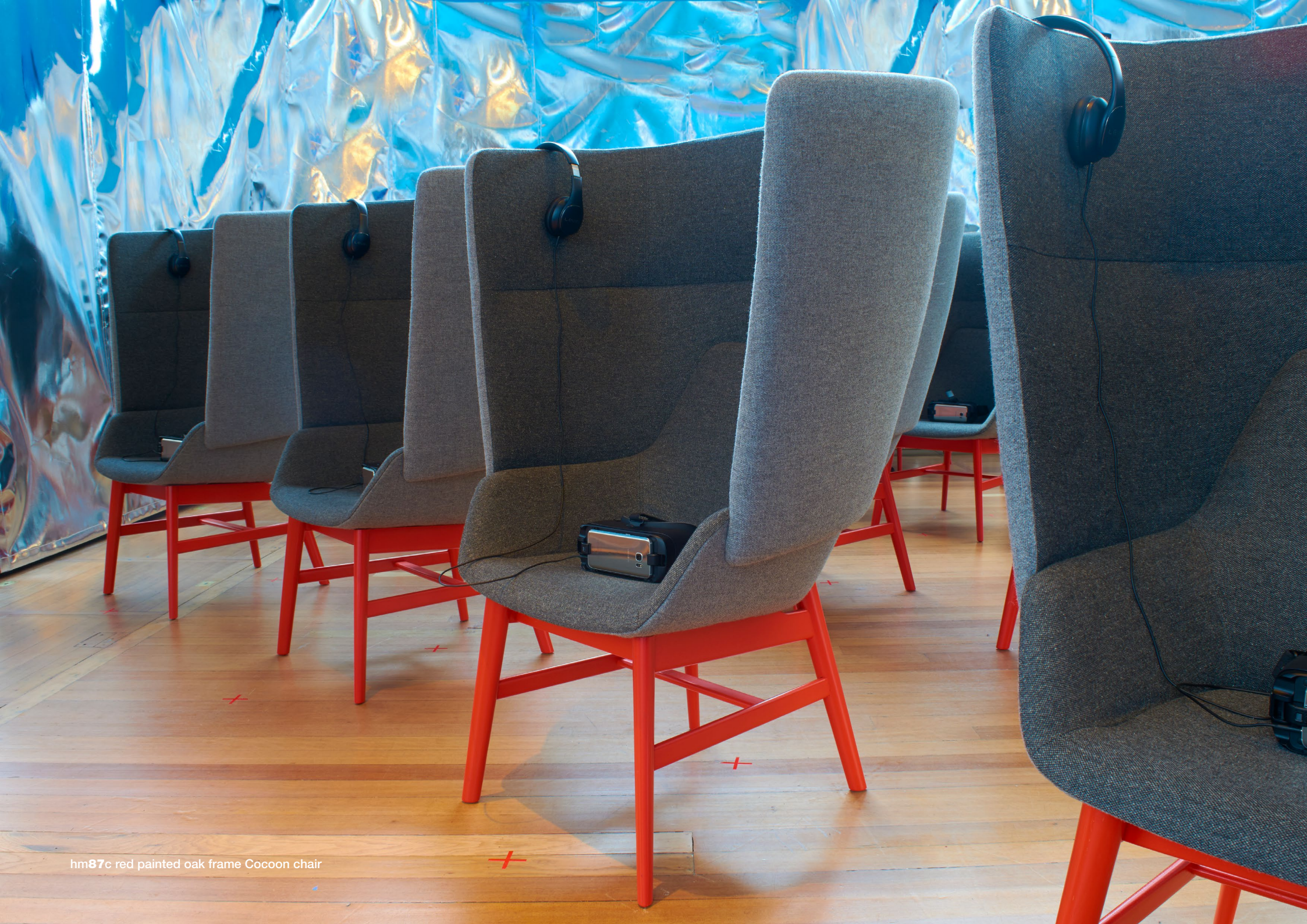
hm87c red painted oak frame Cocoon chair