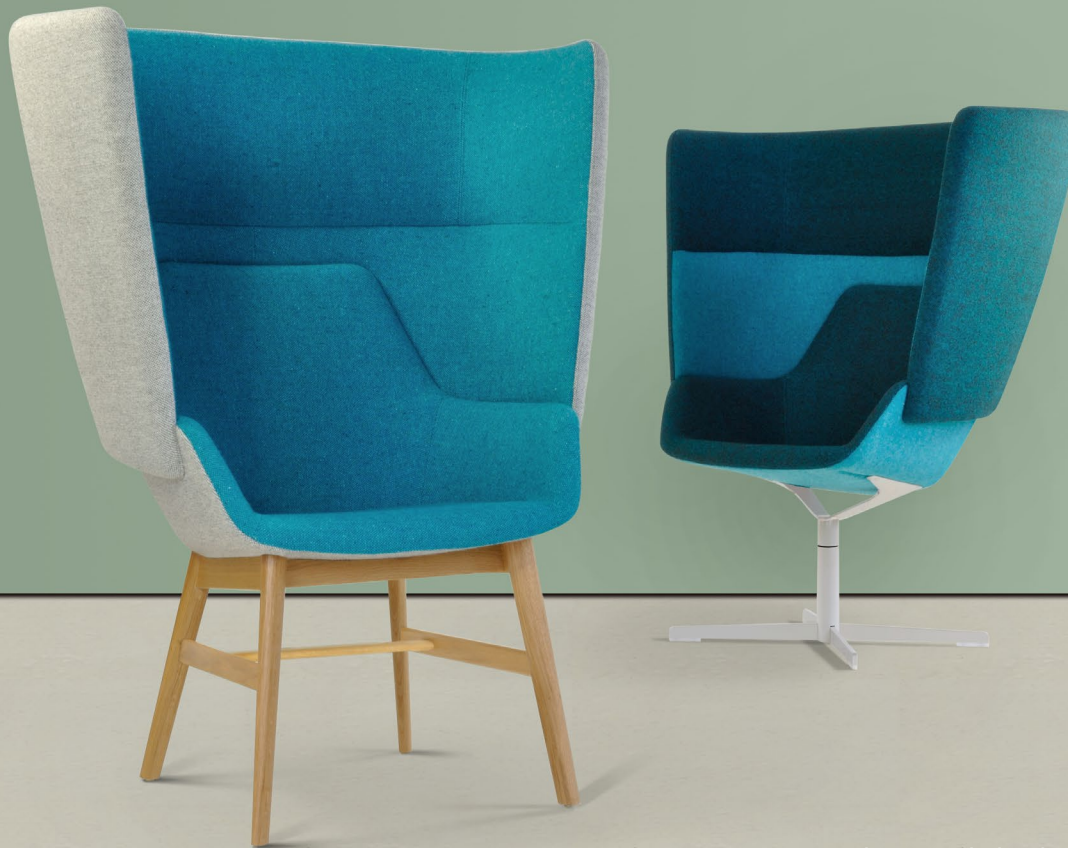
hm87a swivel and c oak frame Cocoons